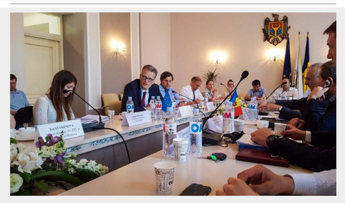
DG Sante and DG Trade visit Moldova