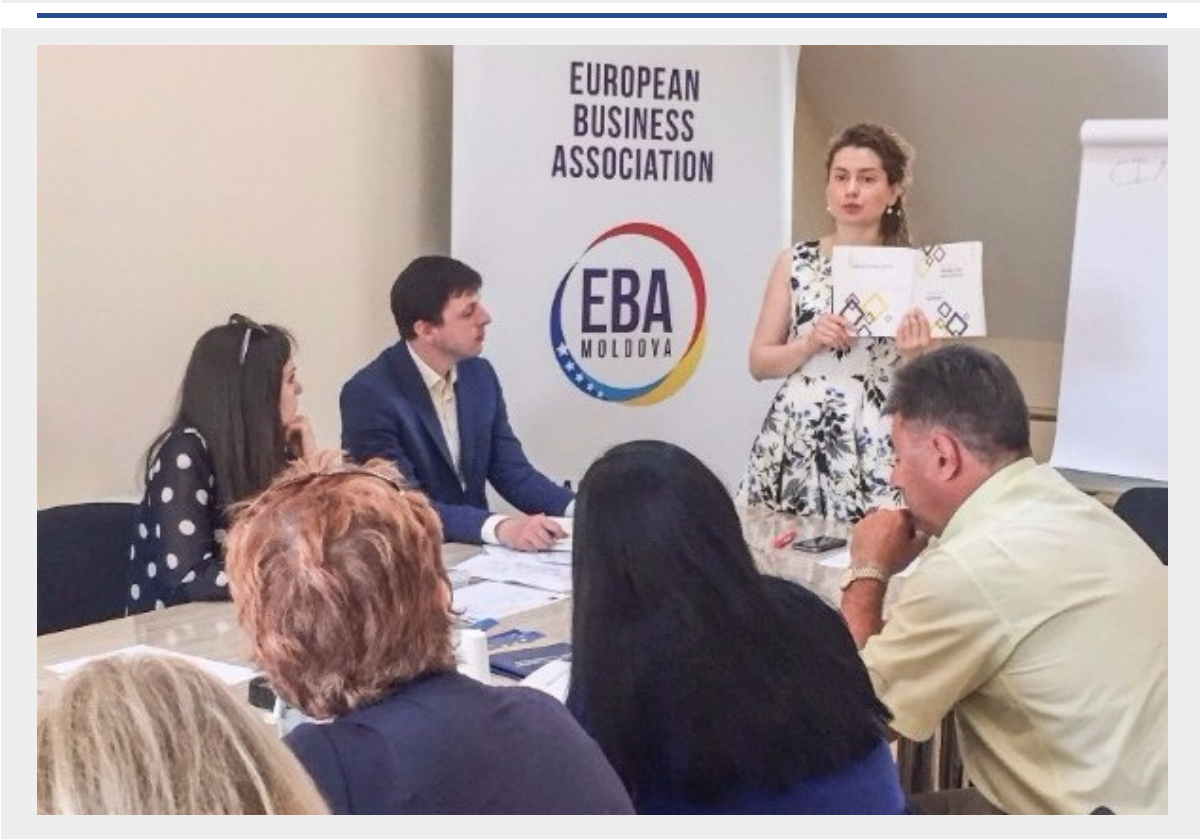
Training visit at EBA