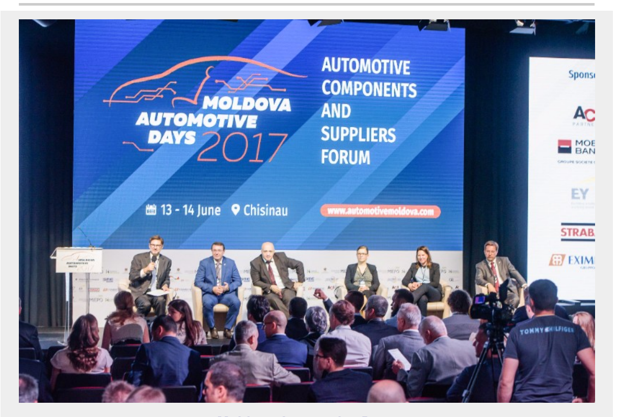
Moldova Automotive Days