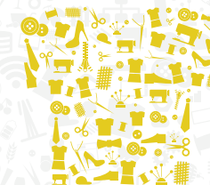
Textile, Apparel, footwear and leather goods